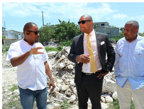
Justice Simons, ISU Strategic Lead (right), and Hon. Charles Washington Misick, Premier of the Turks and Caicos Islands (middle), meet with the Crown Land Unit (left) to assess concerns related to informal settlements.

In addition to engaging with the communities, the ISU will also dialogue with various government agencies and non-governmental organisations to ensure a holistic, collaborative approach is applied in building safer, more sustainable communities for the Turks and Caicos Islands.