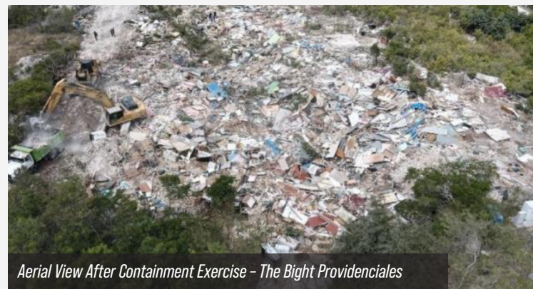
Aerial View After Containment Exercise - The Bight Providenciales