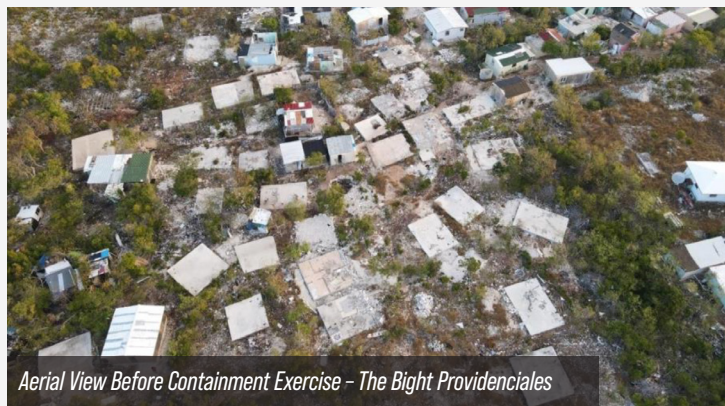
Aerial View Before Containment Exercise - The Bight Providenciales

practical experience in their field, including Communications and Customer Service, Information Technology, Containment, Data Analysis, GIS Analytics, Urban Planning and Project Management, Organisational Development and Training, Legal review and Research, Contract Drafting, and Client Advocacy, Conflict Management, Conflict Resolution and Restorative Practices.